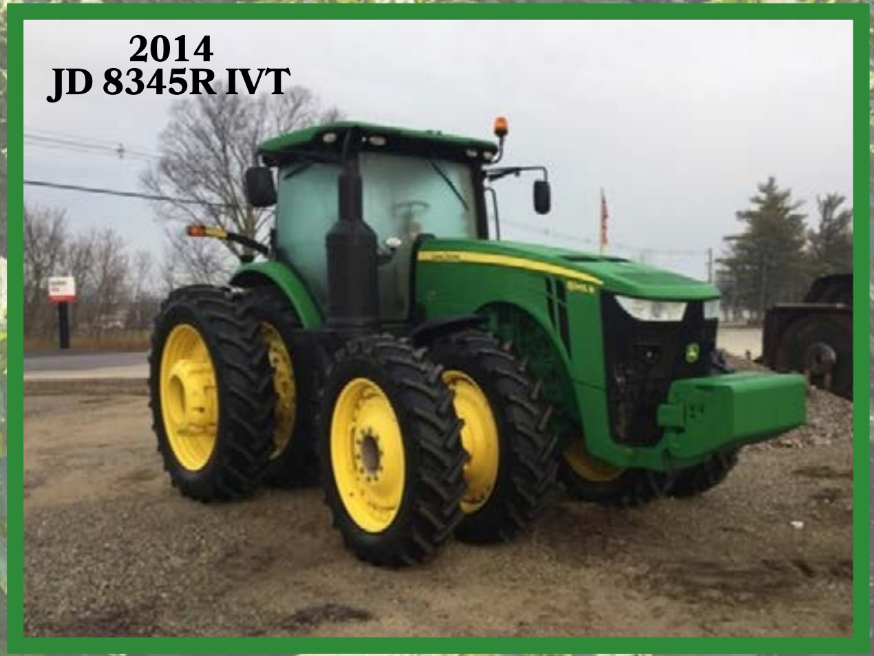
2014 JD 8345R IVT