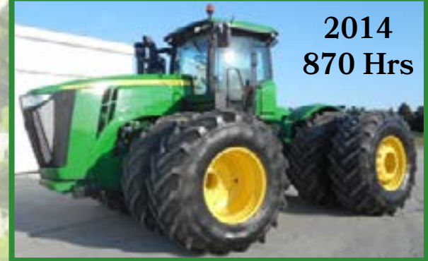
2014 870 Hrs

ADDITIONAL CONSIGNMENT S ACCEPTED DONNA: 616-389-6440