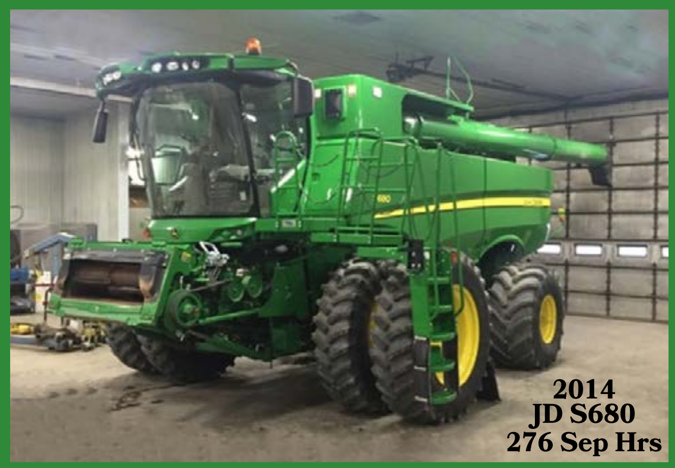
2014 JD S680 276 Sep Hrs

Huge Auction - Highest dollar amount of equipment ever offered in the 25 year history of Bader & Sons Co. Auction!